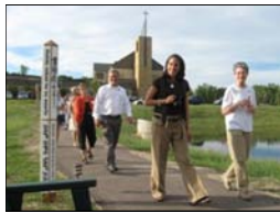
A Peace Site dedication June 2009 at St. Paul's Monastery. The monastery was recently re-dedicated.

In my years of knowledge of Peace Sites, I have witnessed and learned about many