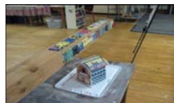
This ceramic birdhouse will be placed atop a completed Peace Pole when Washburn High School becomes a Peace Site in fall 2013.

There is no cookbook for Peace Sites, but they do kindle a candle of peace in the hearts and minds of children and adults wherever they appear. Consider the possibility of a Peace Site where you live. To learn more about Peace Sites, how to become one, and who to contact with questions, visit the World Citizen website at www.peacesites.org .