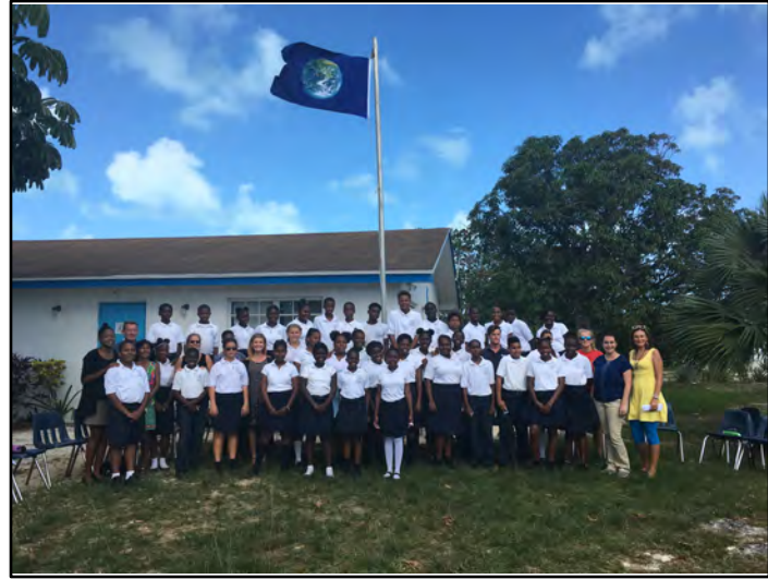
Deep Creek Middle School, Eleuthera, Carribean: International Peace Site!