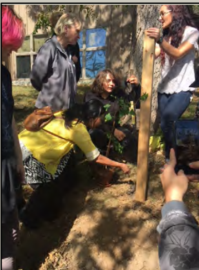
Congratulations to Eagle Bluff Environmental Learning Center in Lanesboro, MN, for becoming a new International Peace Site!